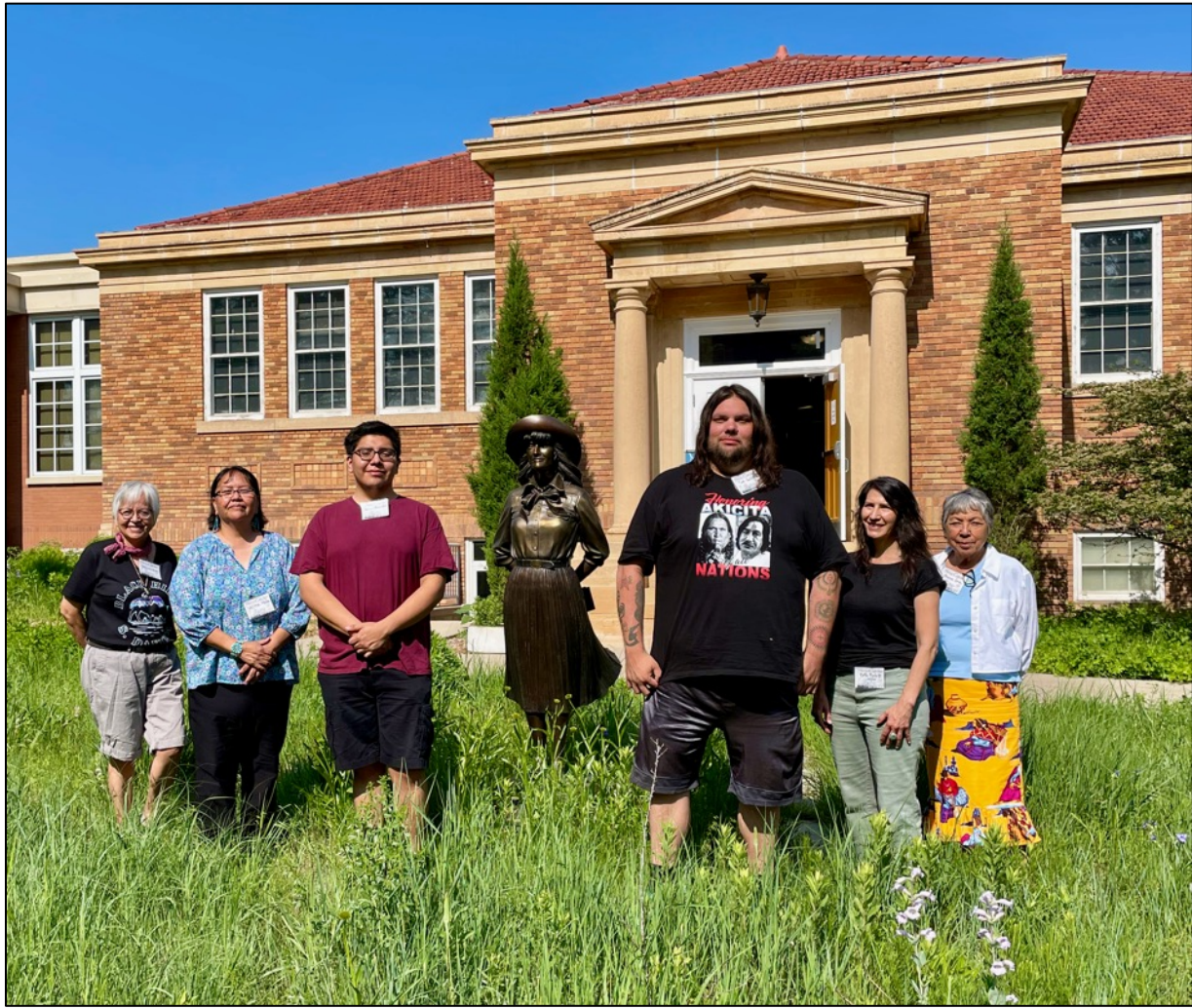
2023 Young Lance Fellowship Recipients with Story Catcher Faculty at the Mari Sandoz Center, Chadron State College