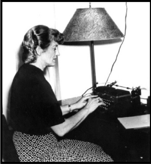
Mari Sandoz at work in Bernard Hall for the 1948 Writer's Institute at the University of Wisconsin at Madison.