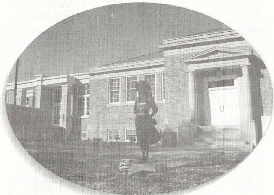
Mari Sandoz High Plains Heritage Center