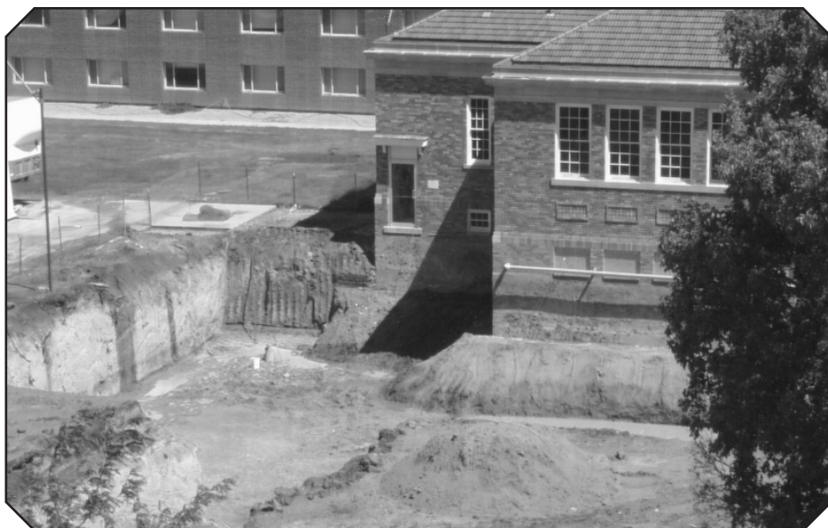
The Mari Sandoz Heritage Center under construction in 2001. Sandoz often expressed a hope for the development of an educational and cultural facility depicting the heritage of the region she called home.

pleasant. I told her of our vision for the future Mari Sandoz Center, as a regional archives and museum for all of northwestern Nebraska, as a place where students, faculty, regional citizens and visiting scholars could do research on regional topics, and as a monument to the life and work of Sandoz.