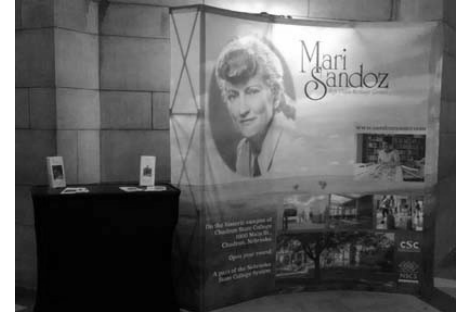
photos L-R Sandoz Society, Lincoln City Libraries Heritage Room and Sandoz Center displays in the first floor rotunda of the Nebraska State Capitol