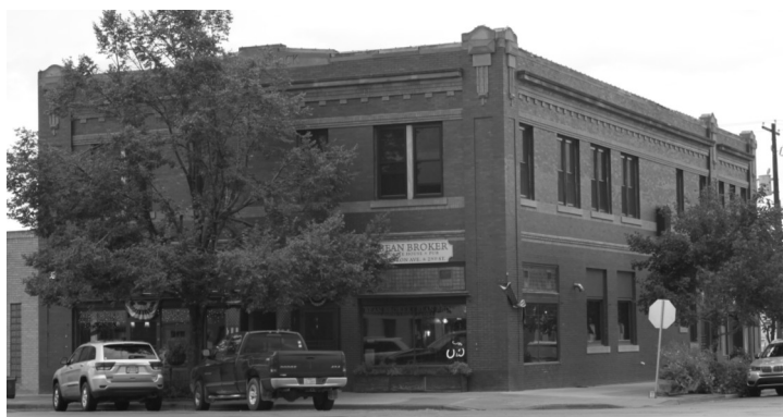
The Bean Broker in downtown Chadron, location of Saturday morning's special conference session (top photo). Mari Sandoz historic site south of Gordon (bottom photo)

Afternoon sessions will be dedicated to time capsule events. Shortly before her death in 1966, Mari Sandoz made some astounding predictions of what life would be like in 2017. After celebrating the truths and errors of these prognostications, a panel of dignitaries will be encapsulating their own projections about what the future for Nebraska will be at its bicentennial.