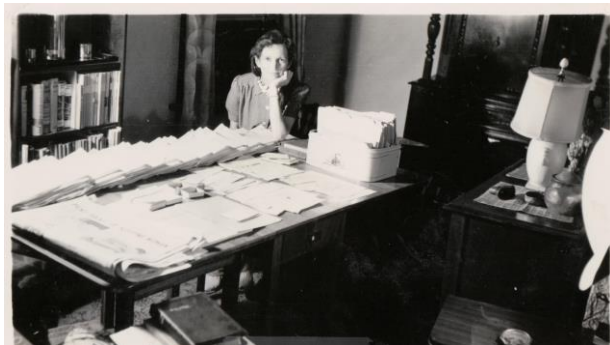
Mari in her Lincoln apartment circa 1935

As part of the 2021 conference, I was honored to deliver the Pilster Great Plains lecture on “the Untapped Potential of the Mari Sandoz Collection.” I told the story of Mari Sandoz and her most prized possession— her research materials—and the people behind the efforts to preserve her heritage and promote her legacy, including this collection, since she passed. As part of our celebration of the fiftieth anniversary of the formation of the Mari Sandoz Heritage Society, my talk was also a proposal for promoting Mari’s legacy over the next fifty years. This paper is an overview of the presentation which can be viewed online at www.marisandoz.org .