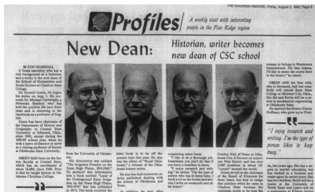
Chadron Record, August 3, 1990