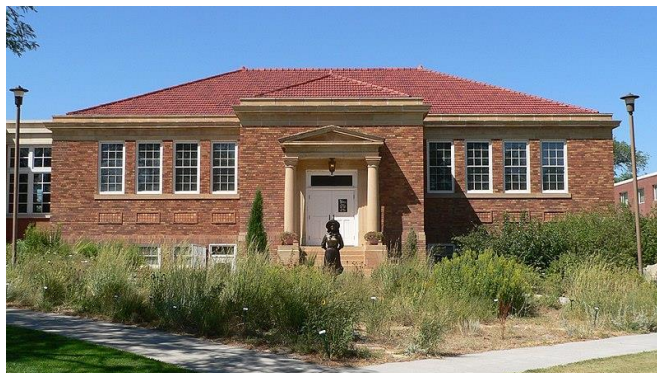
Mari Sandoz High Plains Heritage Center