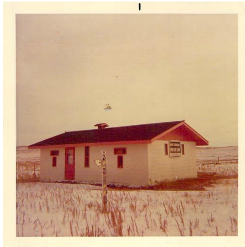
Mari Sandoz Museum, Highway 27 Mari Sandoz Heritage Society Collection

museum under construction on the Sandoz property—cement walls were up but no roof yet. The small building was not located at the gravesite, but at a roadside rest area 22 miles south of Gordon built and maintained by the Sunbeam Calyx Garden Club.