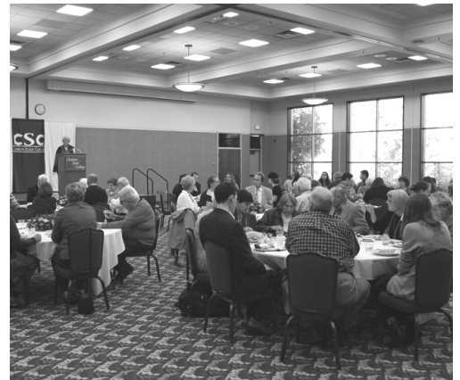
Symposium attendees enjoy lunch and vibrant conversation at the CSC Student Center