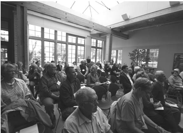
Attendees engaged in learning from a variety of speakers at this year's symposium in the Atrium of the Sandoz Center at CSC