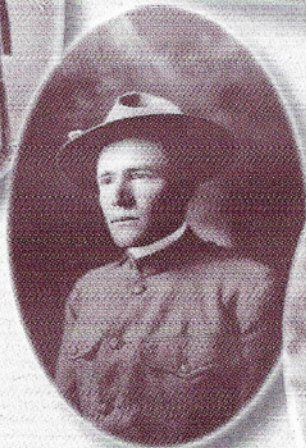
World War I