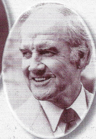
World War II

Keynote Address: "A Time for War, A Time For Peace" by Senator George McGovern